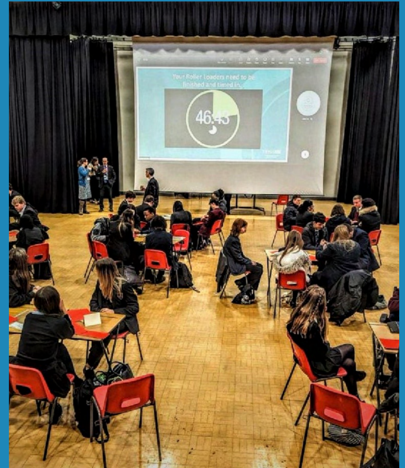
Students taking part in an engineering challenge, part of the Oxford Thinking project .

The Foundation started the partnership four years ago and the real impact will be known in the next year when the first cohort of students will be starting University, but feedback on the programme from pupils, parents and schools has been very positive.